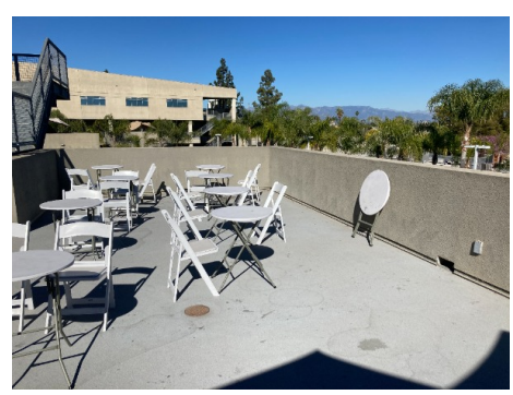
Main Campus Buil...

The stucco soffits, columns, walls, & doors are included