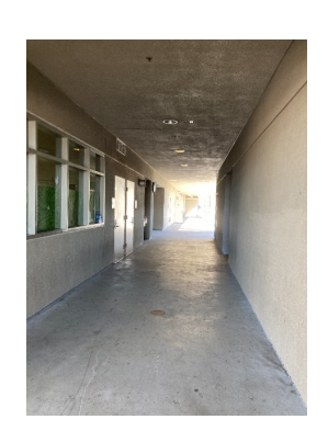
Main Campus Buil...

The long beam and cross beams here are included