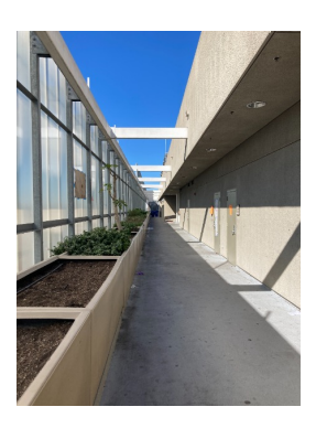
Main Campus Buil...

The long beam and cross beams here are included