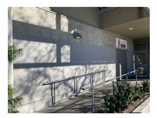
Main Campus Stre...

The previously painted sides are included to be repainted