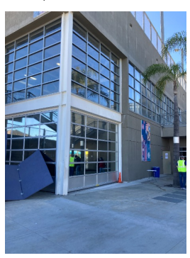
Main Campus Buil...

The white beams are included to be repainted