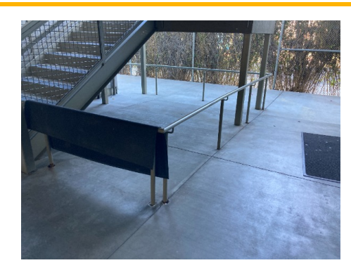
Campus Corner B...

The cafeteria exterior is included on all sides