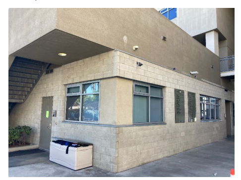
Main Campus Buil...

This CMU will be primed to seal the block prior to painting