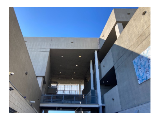
Main Campus Buil...

The unpainted CMU walls will be primed and painted