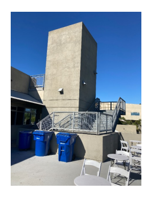
Main Campus Buil...

We will mask and protect doors and awnings while painting