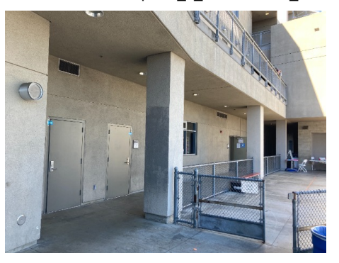
Main Campus Buil...

The white beams are included to be repainted