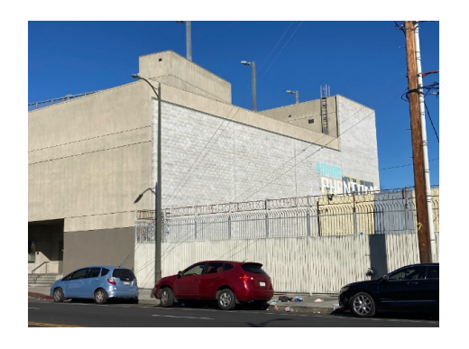
Main Campus Stre...

Close up of the large beams to be repainted