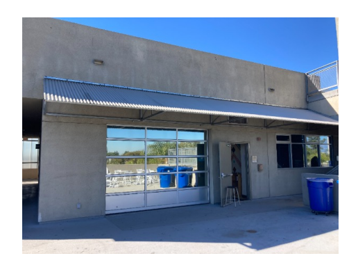
Main Campus Buil...

We will mask and protect doors and awnings while painting