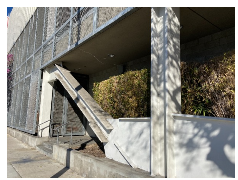
Main Campus Stre...

All stucco on this side are included to be repainted