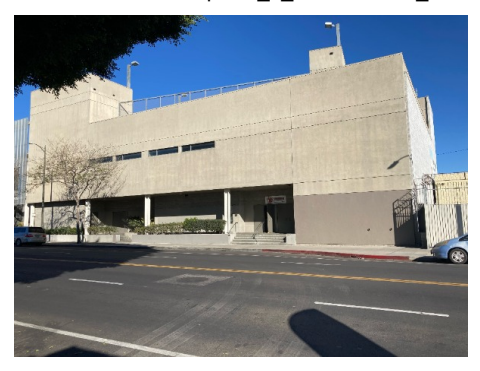
Main Campus Stre...

Walls in red, and beams in yellow are included to be repainted