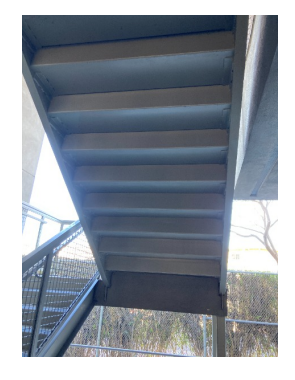
Campus Corner B...