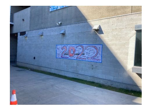
Main Campus Buil...

Stucco soffits, walls, and window frames are included